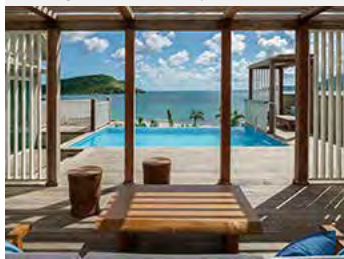
Plunge Pool Rooftop Deluxe Suite

RESORT ADDED VALUES: Family: Kids 12 and under stay free.